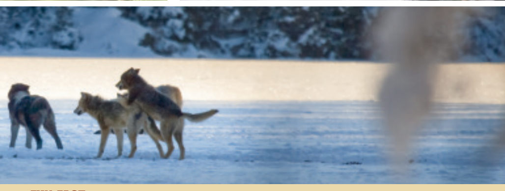
FUN FACT: Minnesota is home to close to 3,000 wolves, more than any other state except Alaska.

also howl to announce their presence and to broadcast the message, "This territory is taken!"