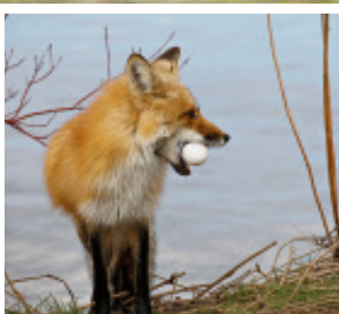
FUN FACT: A red fox sometimes will hide food and come back later to finish its meal.

animals, often using their sense of hearing to find their prey. Sometimes they eat berries, seeds, and nuts too.