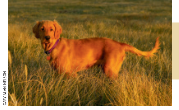
FUN FACT: Domestic dogs bark louder than their wild relatives do.