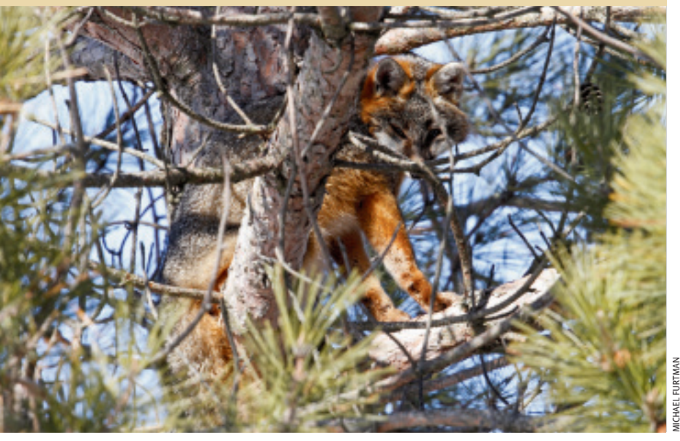
FUN FACT: A gray fox can pull its claws back into its skin similar to the way a cat does.